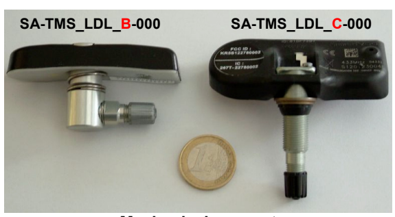
Mechanical concept Wheel unit sensor mounted on the rim of