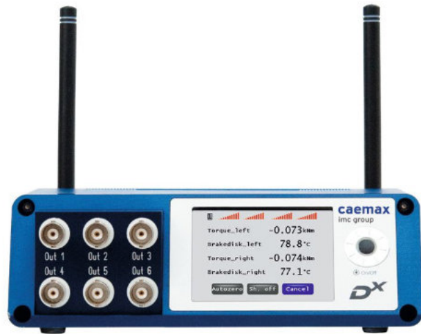
D x -Receiver Unit (RCI)

The D x -Power system allows making mechanical power measurements as easy as child's play. The transmitter unit (D x -SCT) is mounted directly on the vehicle axle by means of a half-shell housing. There it acquires the torque (via strain gauges) as well as the speed via an integrated rpm sensor. The measured data is transmitted telemetrically to the D x -receiver unit (RCI) inside the vehicle. This receiver unit calculates the synchronous values of the two signals in real time according to the formula, power = torque x rpm, and displays all values as physical variables.